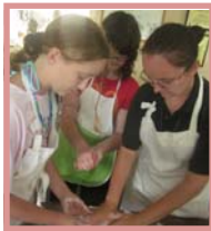
table healthy dishes! Come and explore the basics of the kitchen and then learn more advanced techniques from experts.

culinary arts from our camp chefs. Open to ages 12 to 16. In this class you will be creating a wonderful array of delectable