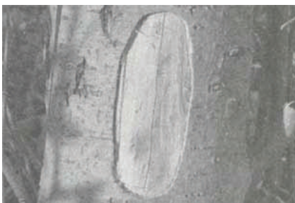
Bark tracing to remove split

When a split occurs on a tree, what should you do? In recent years, quite a bit of research has been done on closure of tree wounds. These investigations have indicated that tree wound paints are of little value in helping a tree to callus over. For this reason, do not paint or try to seal a split with paint or tar. Tracing the bark around the split can be very helpful in aiding wound healing. With a sharp knife, starting from one end of the split, trace around one side of the wound, about 1/2 -1 inch back from the split bark. Stop at the other end and do the same procedure on the opposite side of the split. Knives should be sterilized between cuts by dipping for several minutes in a 1:10, bleach:water solution or a 70% alcohol