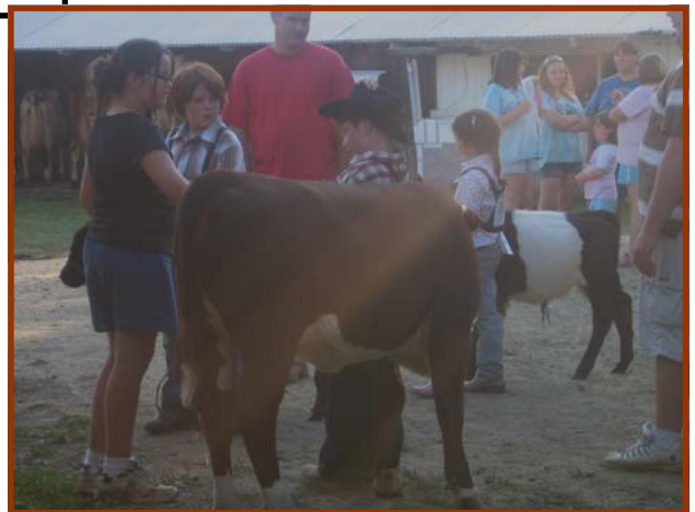
Otsego County Fair, Morris