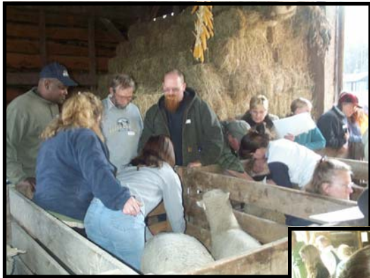
FAMACHA Workshop, The Farmers' Museum and CCE