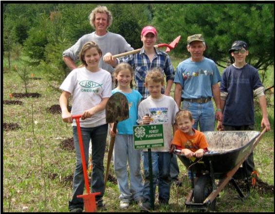
4-H'ers plant pine trees for future club harvest.