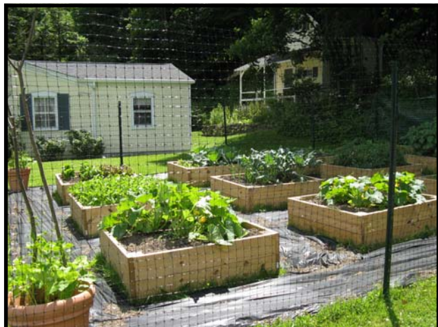
Vegetable "Victory Garden" Cornell Cooperative Extension, Cooperstown