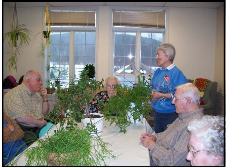
Master Gardeners, Nader Towers, Oneonta