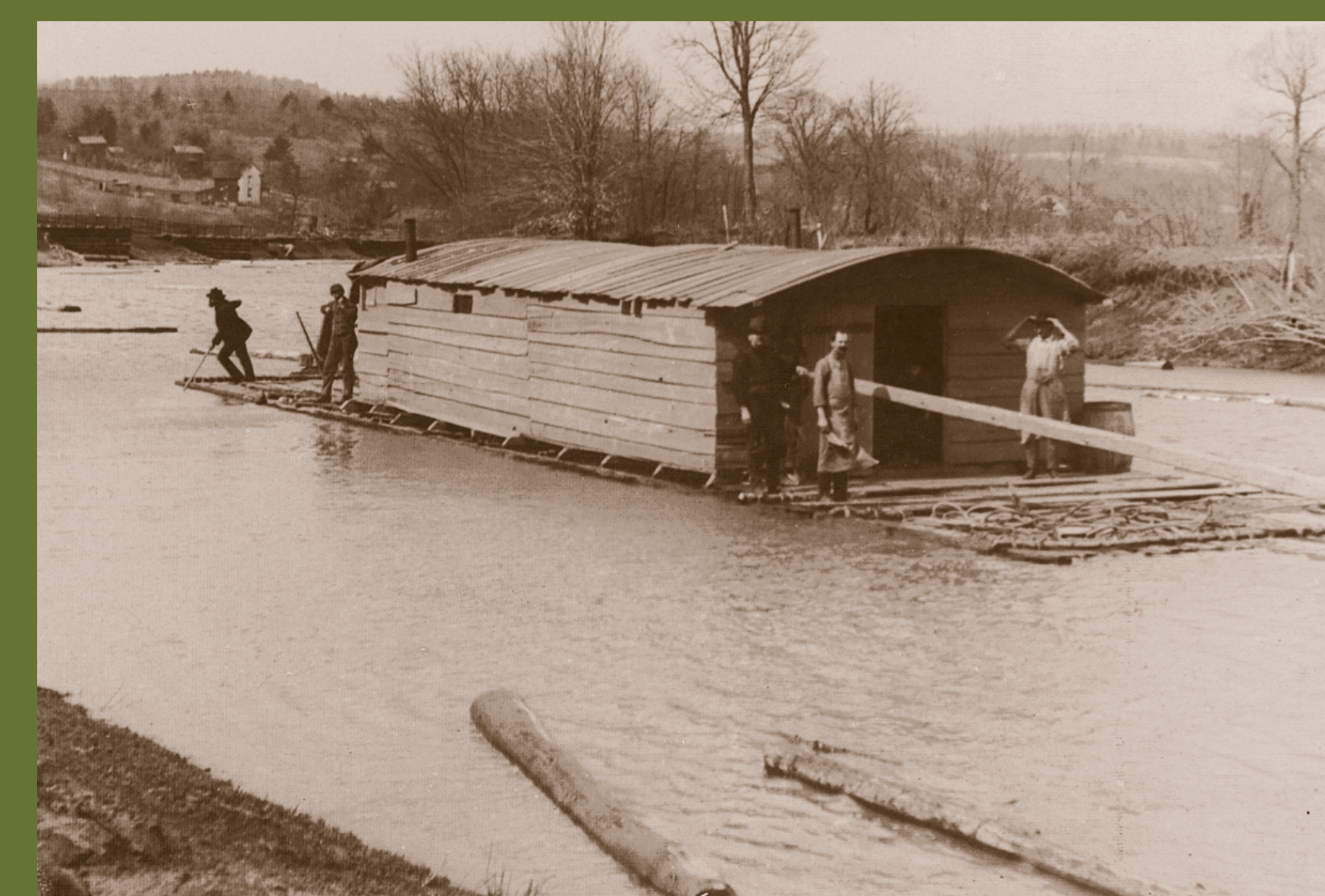
Arks measuring 75 feet by 16 feet transported goods along the rivers all the way to Baltimore.

Each year, up to 60 arks made the trek carrying wheat, pork, venison, flour, maple sugar, black salts, and pot and pearl ash. The trip from Bath to Baltimore took eight days. Upon arrival, the wares