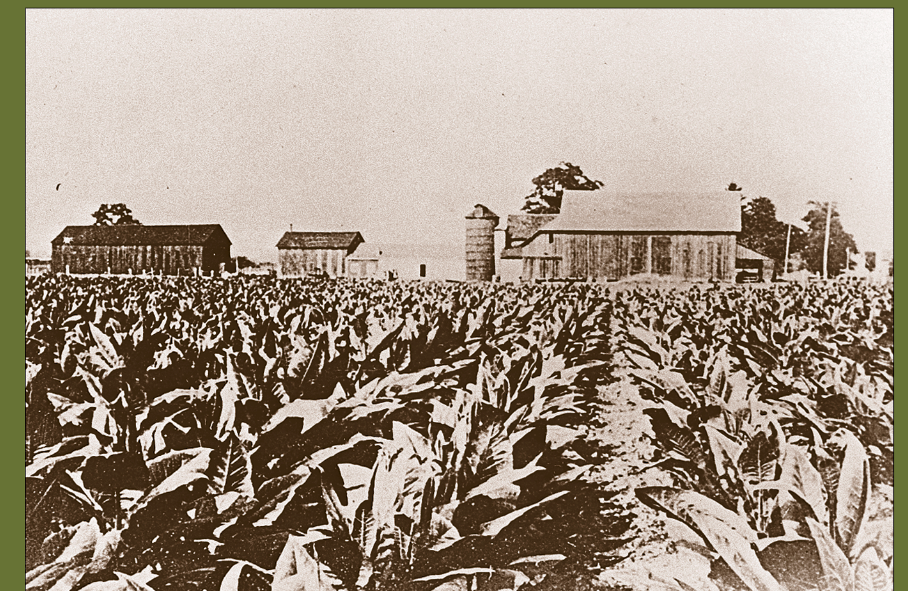
Tobacco farm in the Chemung River Valley.

The Bottchers' involvement in tobacco farming closely parallels trends in tobacco production throughout the Chemung Valley. At its peak, the tobacco industry boasted 200 growers and 1,000 employees locally. "Big Flats Tobacco," as the product was known within the industry, was used primarily in cigars, although it was occasionally incorporated into other tobacco products, such as cigarettes,