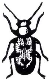
Spotted asparagus beetle (x5)